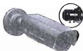
CVC1705 black - varifocal