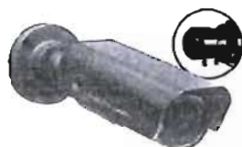
CVC6705 black - varifocal CVC6705W white - varifocal

Cable through the mount for extra security!