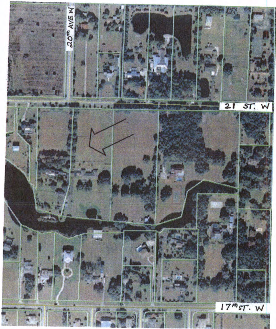
Roy Family ranches 2007 21 st Street W August 2, 2011