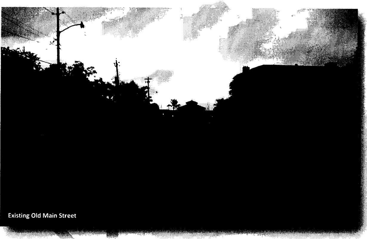
Existing Old Main Street