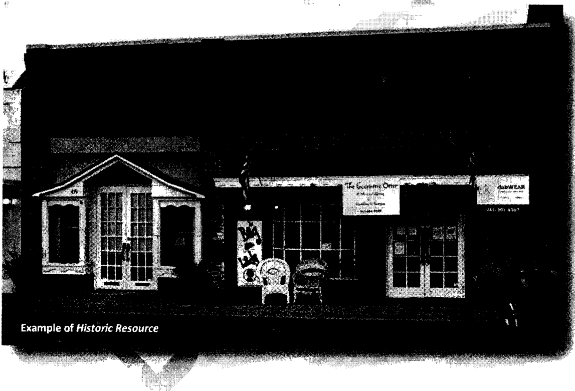
Example of Historic Resource

Stormwater Facilities means Man-made structures that are part of a stormwater management system designed to collect, convey, hold, divert, or discharge stormwater, and may include stormwater, sewer, canals, detention facilities and retention facilities. 22