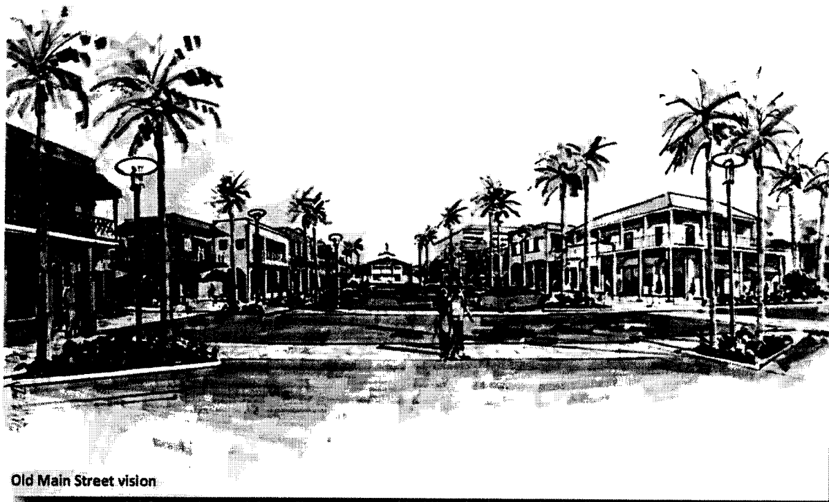
Old Main Street vision